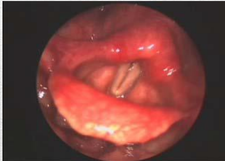
Fig. 1B Score 3