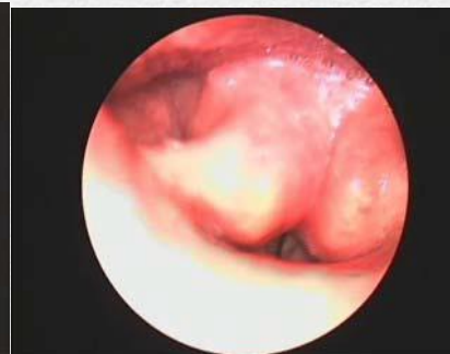
Fig. 1C Score 5