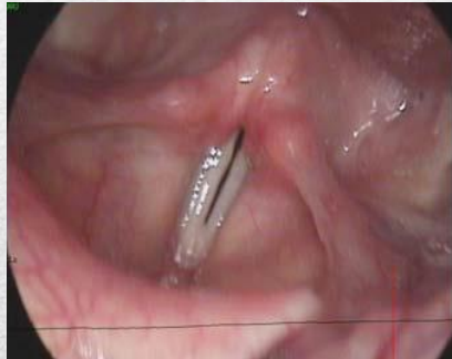
Fig. 1A Score 1